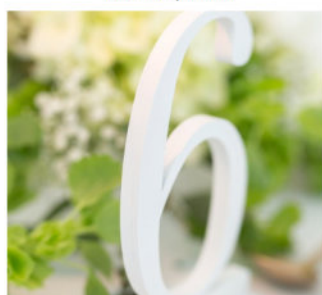
Table numbers $2.00 each