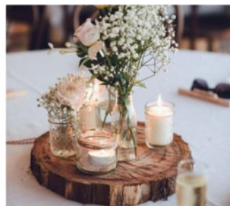
Wooden discs $5.00 each