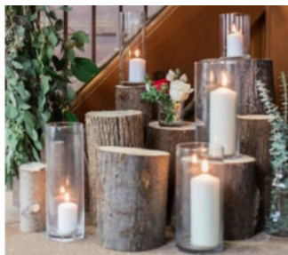
Wooden stumps $5.00 each