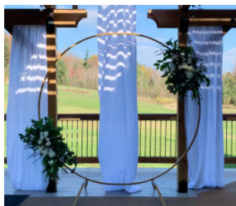
Ceremony Arch $130