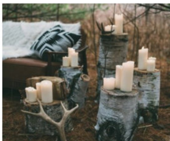
Birch stumps $5.00 each