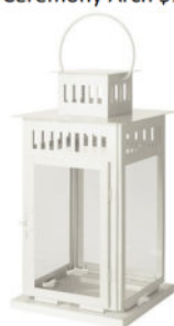
White Lanterns $6.50 each