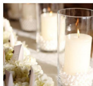
Hurricane Jar $1.50 each