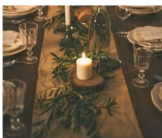
Burlap runner $6.00