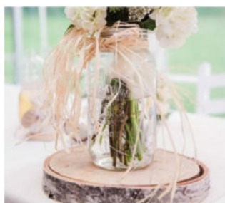
Birch discs $5.00 each