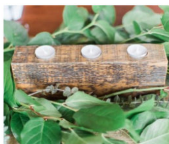
Wood votive $3.00